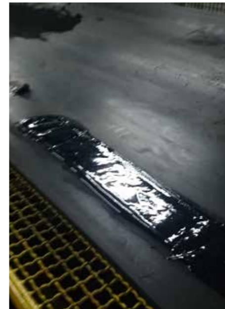
Repair made before equalization of surface