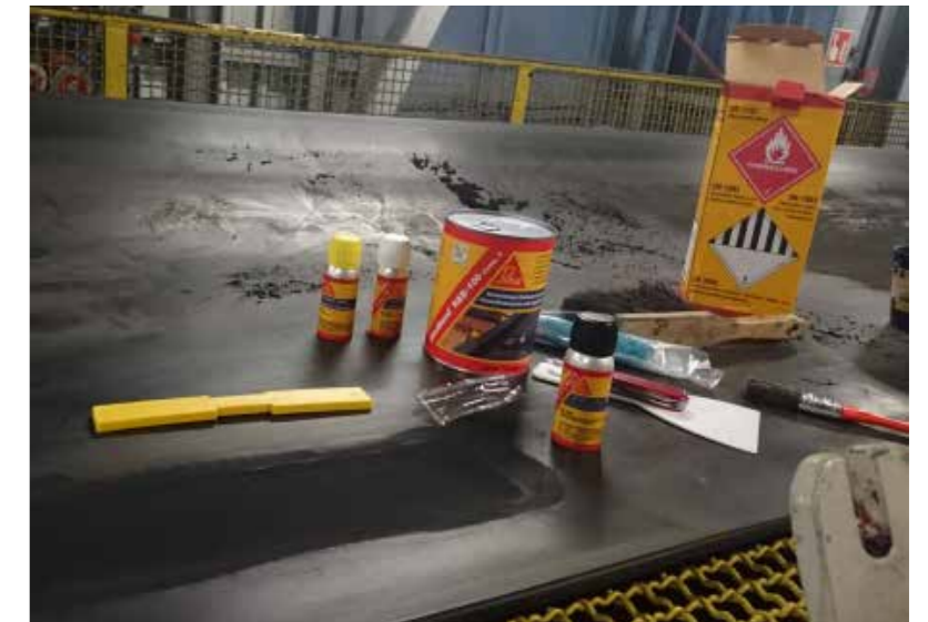
Belt surface prepared for application of Sika Bond R & B 100