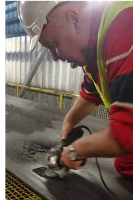
Mechanical preparation of the belt surface